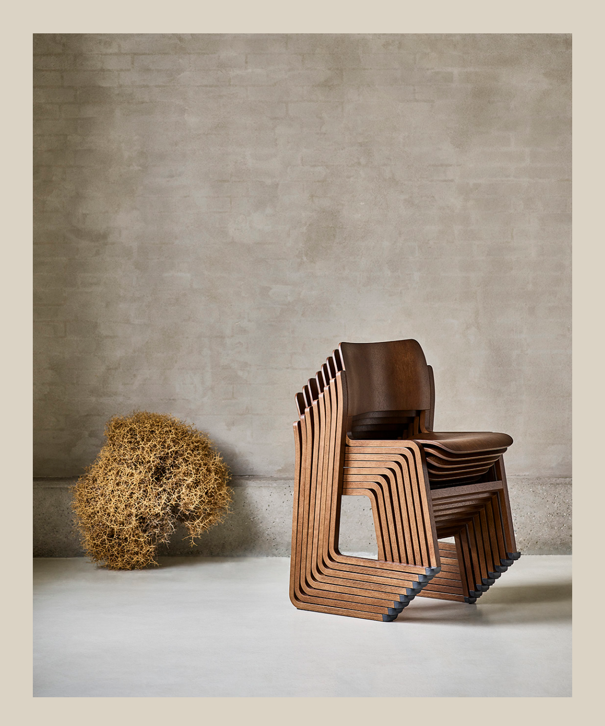
COLOUR REFERENCE ONLY Variations in colours and structures may occur Subject to ongoing changes and adjustments